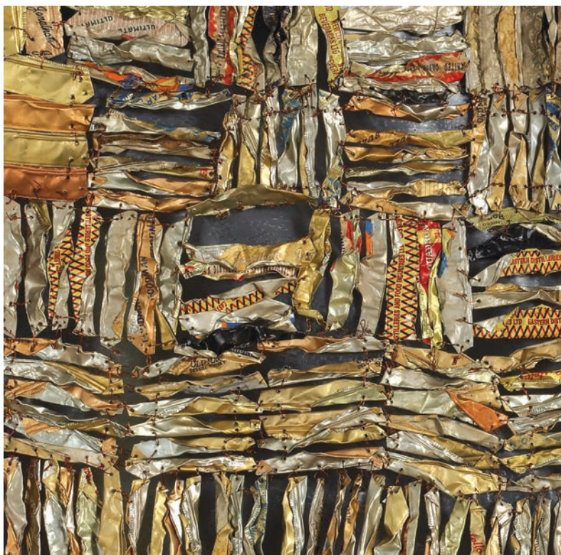
PLATE 2. El Anatsui, Hovor II (2004), detail.

Line 1 Line 2 Line 3 Line 4 Line 5 Line 6 Line 7 Line 8 Line 9 Line 10 Line 11 Line 12 Line 13 Line 14 Line 15 Line 16 Line 17 Line 18 Line 19 Line 20 Line 21 Line 22 Line 23 Line 24 Line 25 Line 26 Line 27 Line 28 Line 29 Line 30 Line 31 Line 32 Line 33 Line 34 Line 35 Line 36 Line 37 Line 38