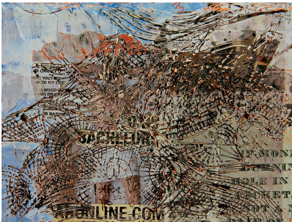
PLATE 5. Mark Bradford, PARATE (2008). Mixed-media collage on canvas. 36 × 48 in.

Line 1 Line 2 Line 3 Line 4 Line 5 Line 6 Line 7 Line 8 Line 9 Line 10 Line 11 Line 12 Line 13 Line 14 Line 15 Line 16 Line 17 Line 18 Line 19 Line 20 Line 21 Line 22 Line 23 Line 24 Line 25 Line 26 Line 27 Line 28 Line 29 Line 30 Line 31 Line 32 Line 33 Line 34 Line 35 Line 36 Line 37 Line 38