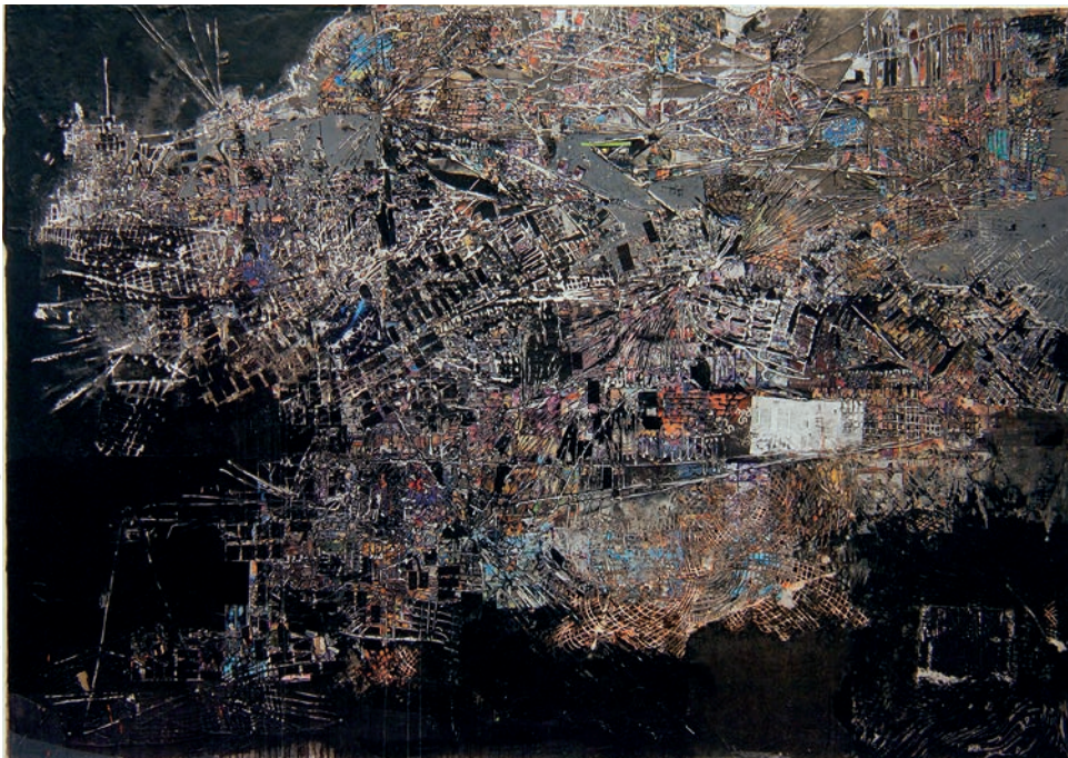
PLATE 7. Mark Bradford, A Truly Rich Man Is One Whose Children Run into His Arms Even When His Hands Are Empty (2008). Photomechanical reproductions, acrylic gel medium, comic-book paper, carbon paper, acrylic paint, caulking, and additional mixed media on canvas. 102 × 144 in.

Line 1 Line 2 Line 3 Line 4 Line 5 Line 6 Line 7 Line 8 Line 9 Line 10 Line 11 Line 12 Line 13 Line 14 Line 15 Line 16 Line 17 Line 18 Line 19 Line 20 Line 21 Line 22 Line 23 Line 24 Line 25 Line 26 Line 27 Line 28 Line 29 Line 30 Line 31 Line 32 Line 33 Line 34 Line 35 Line 36 Line 37 Line 38