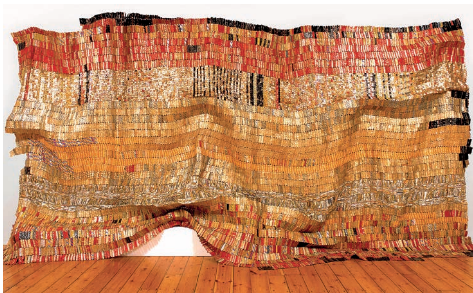
PLATE 3. El Anatsui, Fading Cloth (2005). Woven aluminum bottle caps and copper wire. 126 × 256 in.

Line 1 Line 2 Line 3 Line 4 Line 5 Line 6 Line 7 Line 8 Line 9 Line 10 Line 11 Line 12 Line 13 Line 14 Line 15 Line 16 Line 17 Line 18 Line 19 Line 20 Line 21 Line 22 Line 23 Line 24 Line 25 Line 26 Line 27 Line 28 Line 29 Line 30 Line 31 Line 32 Line 33 Line 34 Line 35 Line 36 Line 37 Line 38