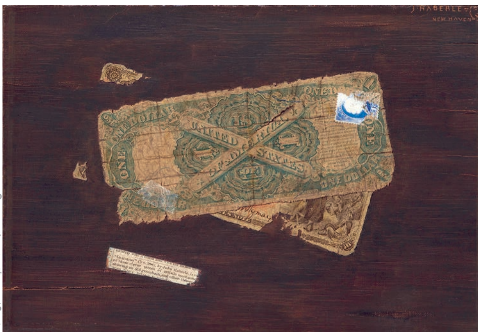
PLATE 4. John Haberle, U.S.A. (1889). Oil on canvas. 8.5 × 12 in. Indianapolis Museum of Art. Gift of Paul and Ruth Buchanan.